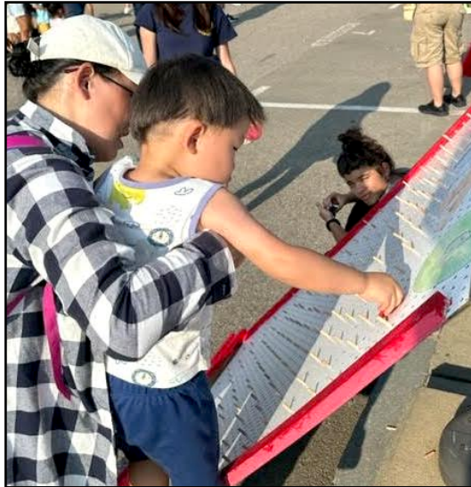
At left a preschooler tries his hand at one of the many creative games for all ages available at the well-attended "Back to School Fest" held at the Malden High School courtyard on Wednesday, September 6. Above, Malden High Class of 2024 and 2025 student dish out some tasty slush.