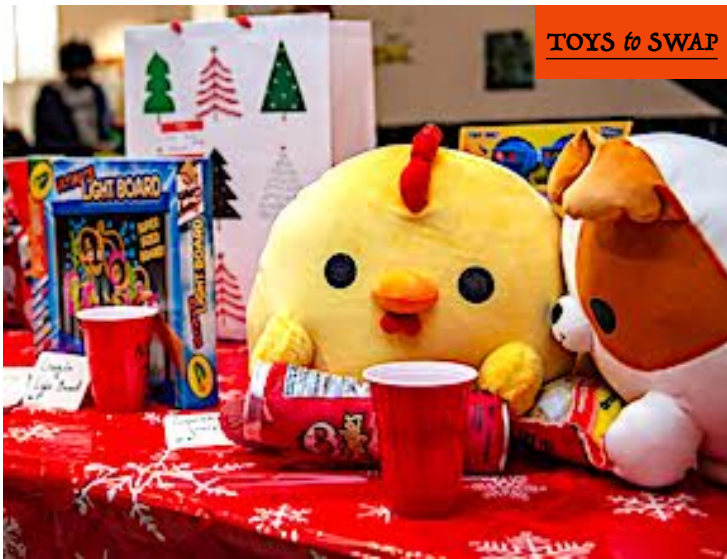
TOYS to SWAP