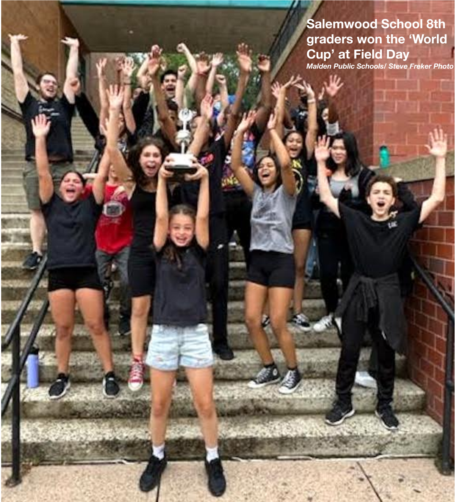
Salemwood School 8th graders won the 'World Cup' at Field Day

All of our schools have special activities to celebrate end of year