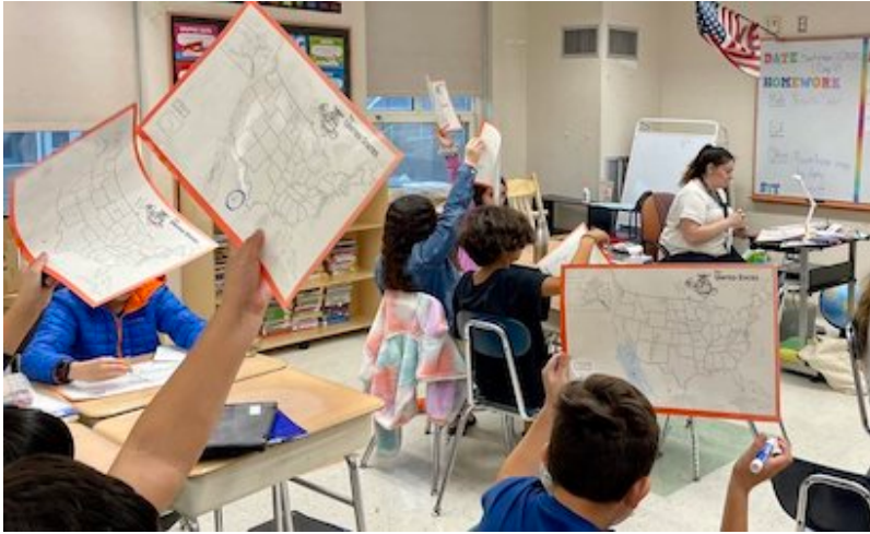
Cartographers at the Ferryway School

There is a lot going on around the MPS K-8 Schools & Early Learning Center