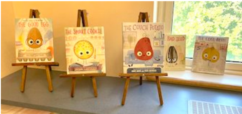
Some fine reading selections at Beebe School