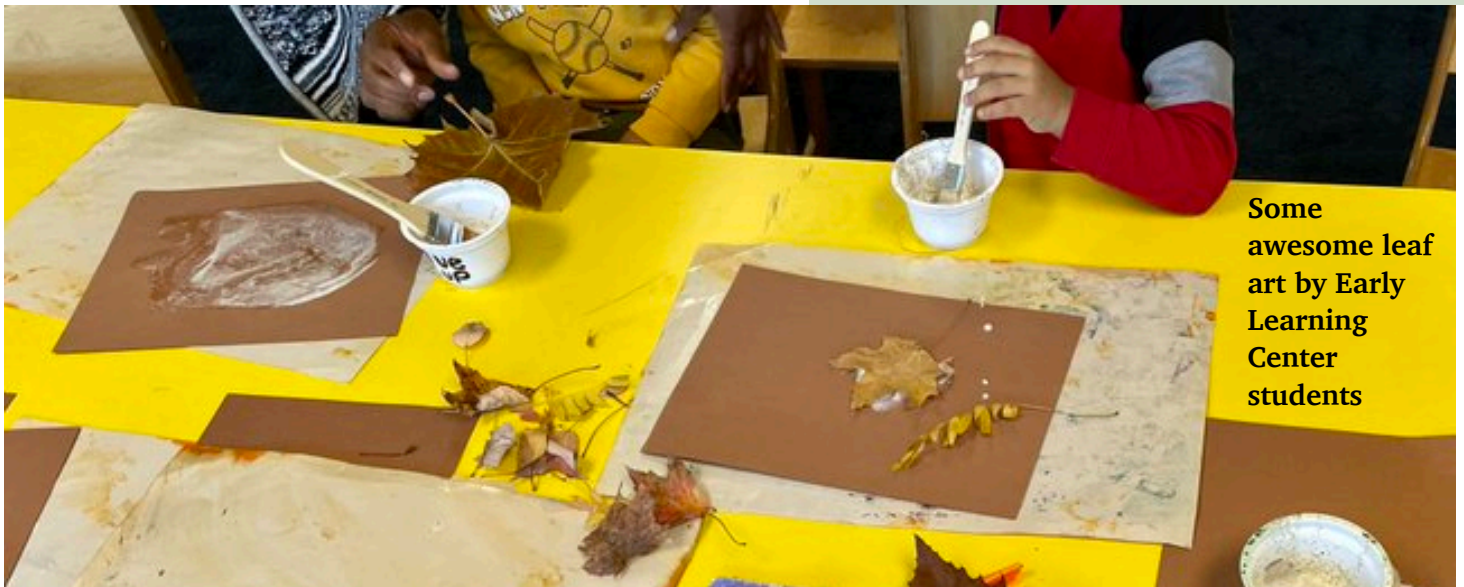
Some awesome leaf art by Early Learning Center students