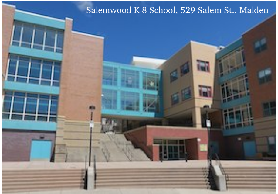
Salemwood K-8 School, 529 Salem St., Malden