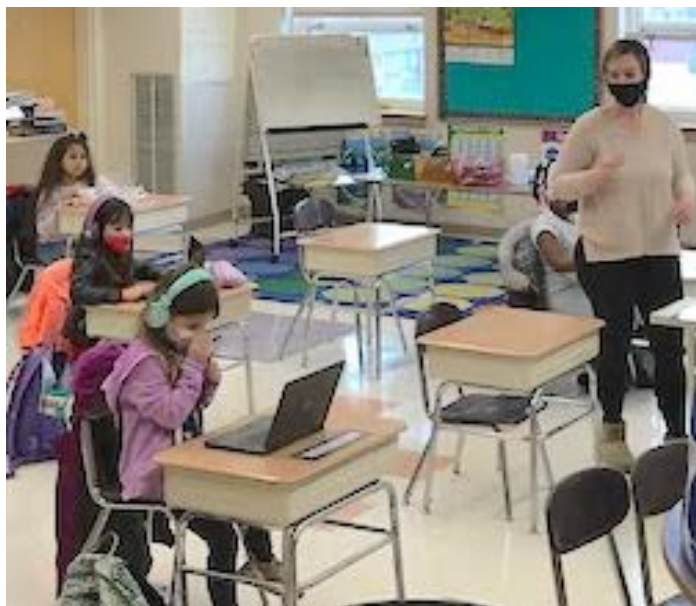
Students settle in at the Freeway School third grade on first day or return to hybrid learning.