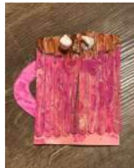
Hot Chocolate Mug