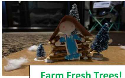
Farm Fresh Trees!