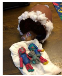
Bear den & bears preparing for hibernation!