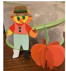
3D Pumpkin & Scarecrow!