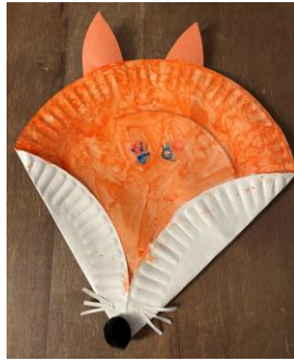
Paper Plate Fox