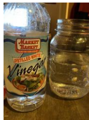
Dancing Corn Experiment!