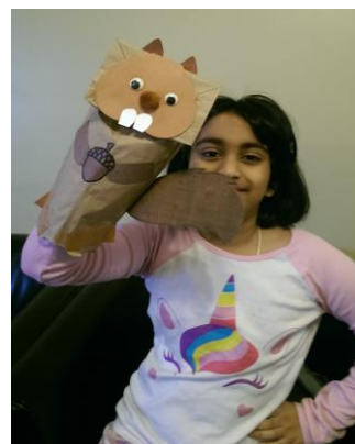
Paper Bag Squirrel