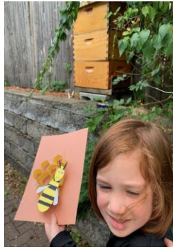
Honey Bee Farm!