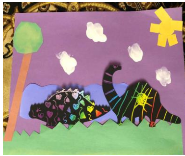
Dino Scratch Art Scene