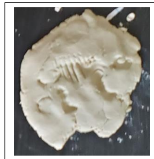
Dinosaur Clay Imprints