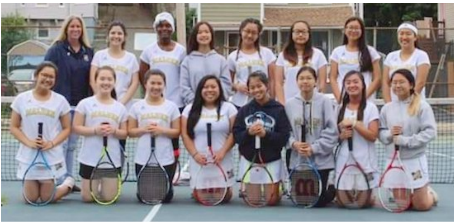
The MHS Tornado Girls Tennis Team earned a spot in the MIAA Division 1 State Tennis Tournament this season.