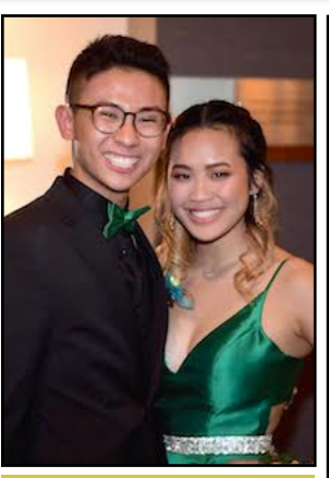
Prom Season at Malden High School