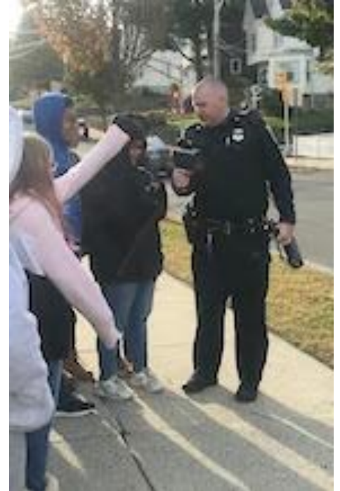
Malden Police were on hand to show how STEM themes were used on the job for officers. Above, Ferryway students are shown how to operate a radar gun to gauge a vehicle's speed.