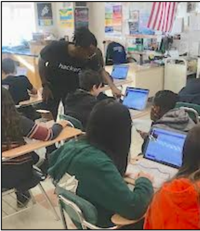
STEM WEEK: Some instruction at the Ferryway School. More Photos, P.6