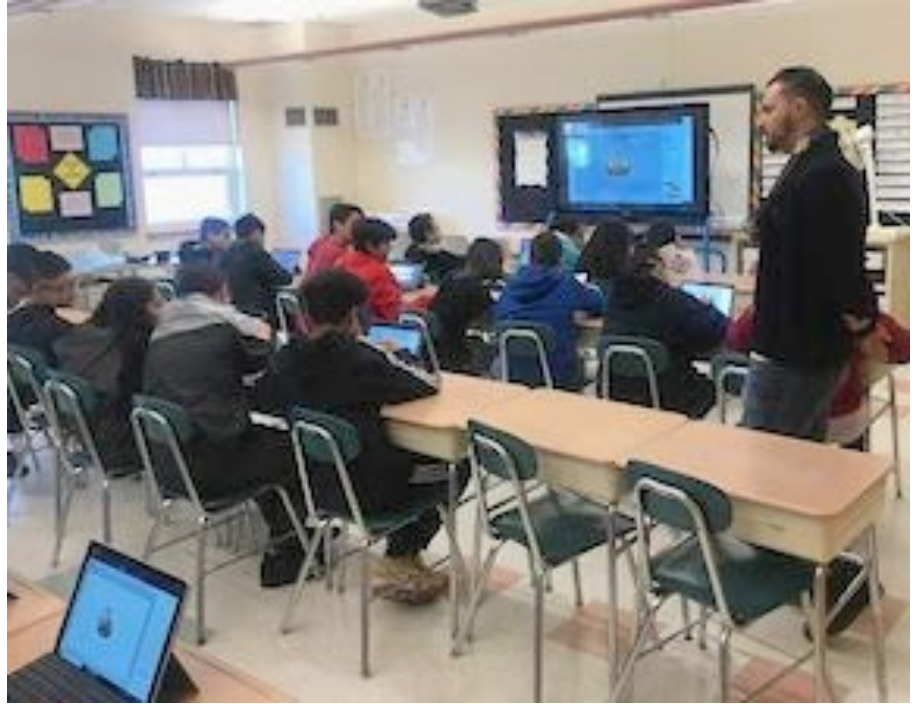
Digital illustration was the topic of one session during STEM Fest.