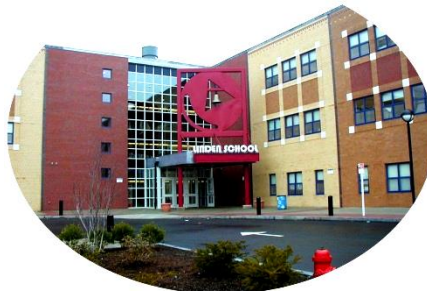
LINDEN S.T.E.A.M. ACADEMY