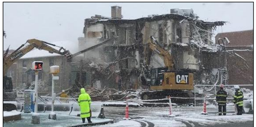
The snow did not hinder operations a bit today (above) at the One Salem St, demolition site. Nor did the rain yesterday (other Photos).