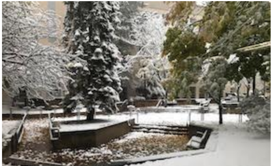
'Winter Wonderland' in October in MHS Courtyard today...

IT'S "SNOW" JOKE: WINTER HITS EARLY... RECORD SNOW TODAY!