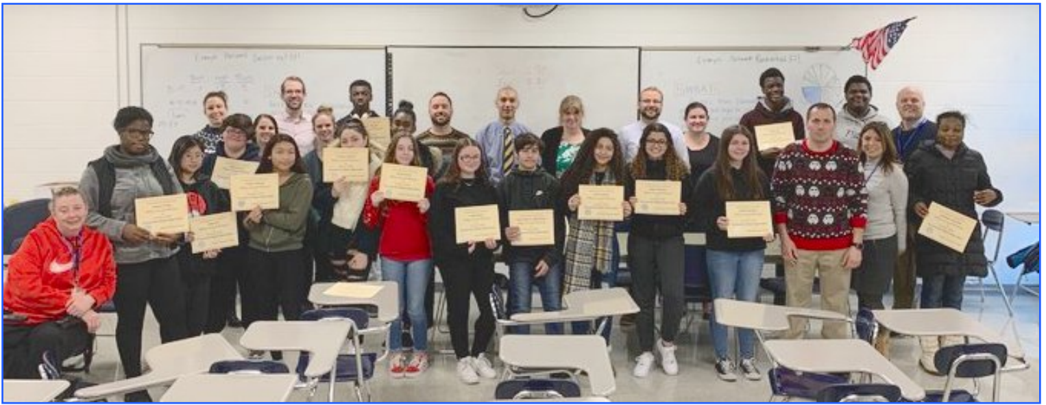
PILLAR AWARD WINNERS HONORED — Congratulations to the October PILLAR AWARD WINNERS, who were acknowledged at a 'Reveal Reception' this week. Individual Photos of the 20 Malden High School students who were nominated by MHS staff and selected for their outstanding contributions to the MHS community are on display in the first-floor hallway across from Cafeteria B.