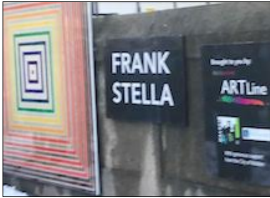
MURAL IN ARTIST'S NAME @ MHS— Malden Arts created a mural at MHS in the name of famous artist Frank Stella Page 4