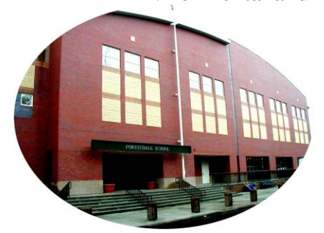
FORESTDALE SCHOOL International Studies