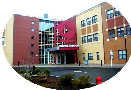
LINDEN S.T.E.A.M. ACADEMY