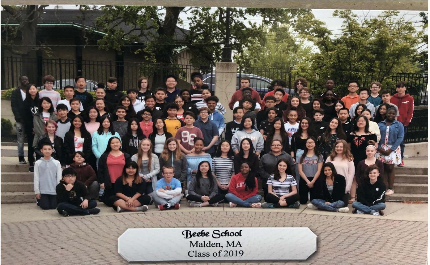
Beebe School Malden, MA Class of 2019