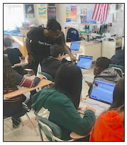
STEM WEEK: Some instruction at the Ferryway School. More Photos, P.6