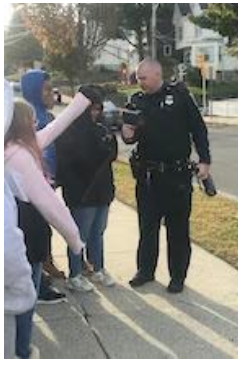
Malden Police were on hand to show how STEM themes were used on the job for officers. Above, Ferryway students are shown how to operate a radar gun to gauge a vehicle's speed.