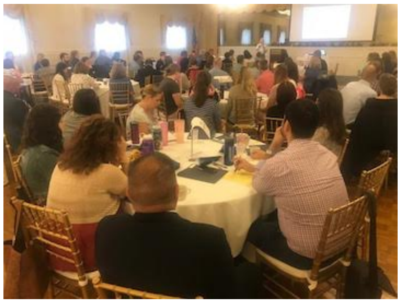
Over 50 new educators in Malden Public Schools this year.