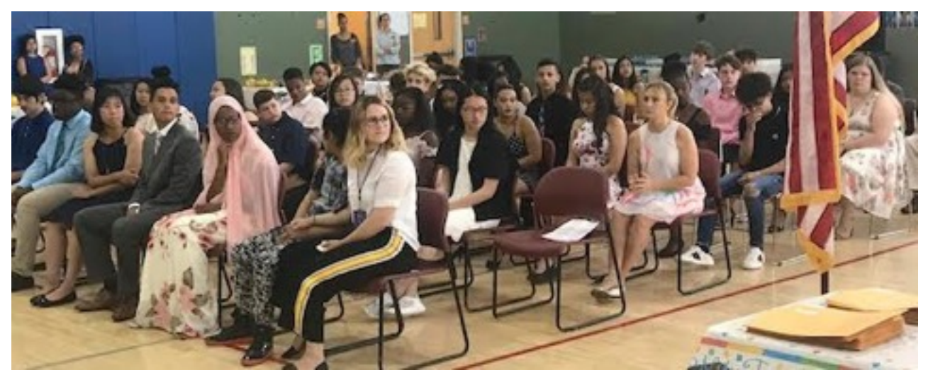
Ferryway School eighth graders are guests of honor at the graduation ceremony Wednesday.