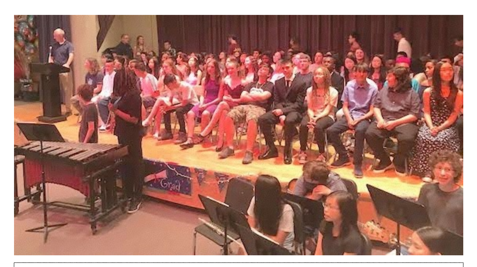
The Class of 2018 at the Beebe School is ready to graduate and members of the Beebe Band are ready to send them off with some musical accompaniment.