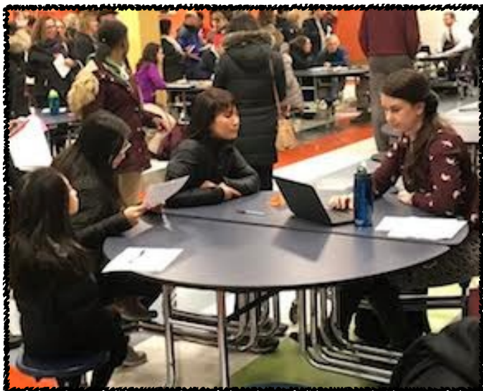
PARENT-TEACHER NIGHTS have been drawing good attendance citywide, including at Malden High School, shown above.