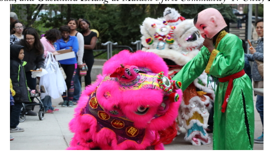
Performance by Wah Lum Kung Fu and Tai Chi Academy, performing the Lion Dance.