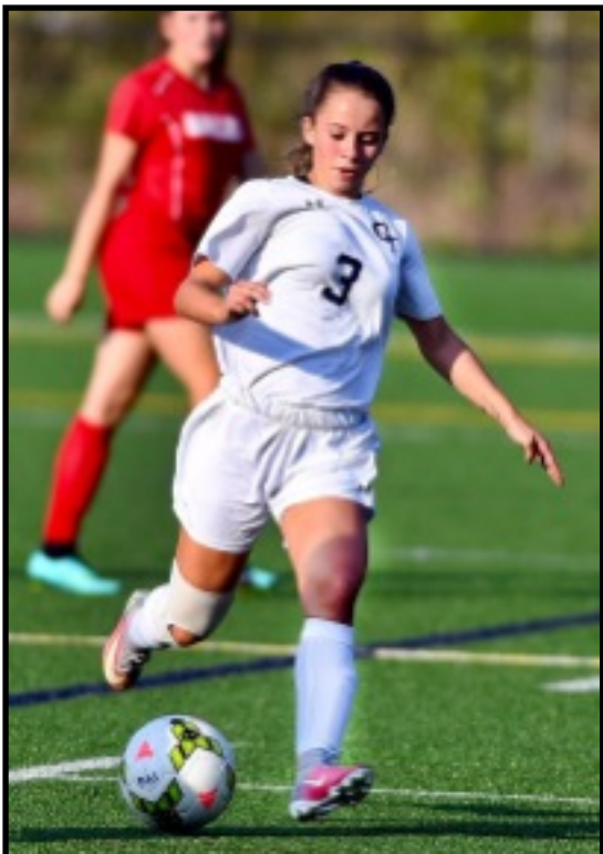
MALDEN'S A 'SOCCER TOWN'! Both Malden High boys and girls varsity teams MIAA State Soccer Tourney Bound! Boys soaring to 13-1-2... Girls solid at 8-3-1