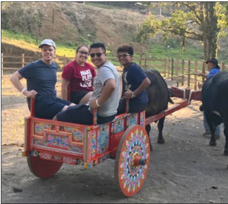
Great trip to Costa Rica by MHS students/Staff! See P.3

Tornado Travelers have a fantastic time in Costa Rica!