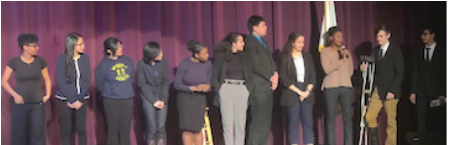
Members of the MHS Speech & Debate Team on Debate Night at Jenkins Auditorium.