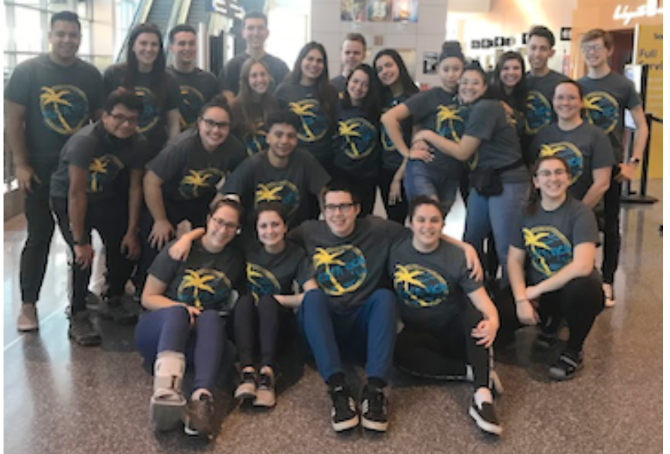
MHS students who are members of the Tornado Travelers Club are shown during their February Vacation trip to Costa Rica. Above, at Logan Airport. Below, visiting a volcano site.

Throughout the week, students were able to experiment with Costa Rican cuisine (which was a lot of rice and beans ) and they