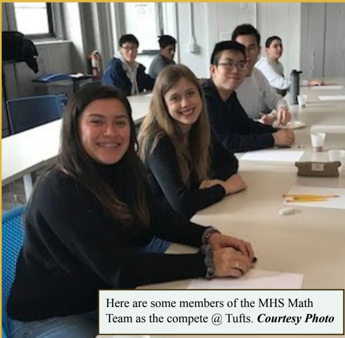
Here are some members of the MHS Math Team as they compete @ Tufts.