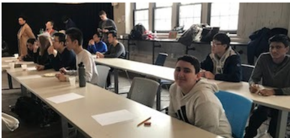
Students compete in 'Pi Day' at Tufts University.