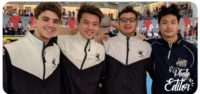
Successful Malden High swim team is shown above