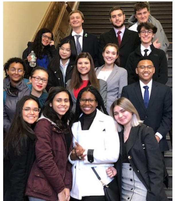
The MHS Mock Trial Team made it to the Sweet 16 in statewide competition for the first time ever.