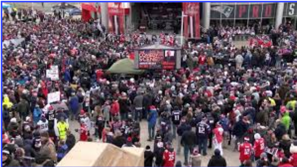
Over 35,000 turned out at Gillette Stadium for the Patriots sendoff rally.

Tom Brady and the New England Patriots will take on the Los Angeles Rams on SUPER SUNDAY Feb. 3 in Super Bowl LIII in Atlanta. The Malden High School community joins those across New England in wishing the team good luck in their quest for a sixth Super Bowl Title, all under Brady and Head Coach Bill Belichick! GO PATS! BEAT L.A.!