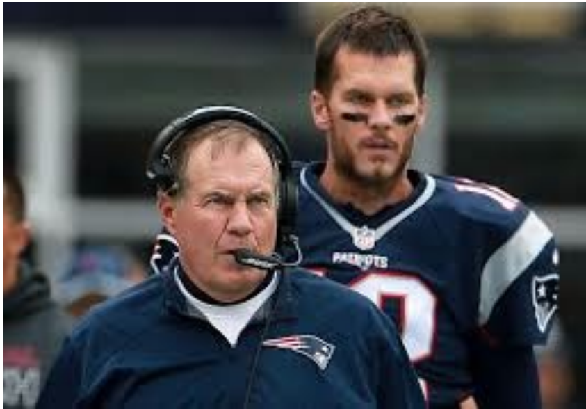
Patriots Head Coach Bill Belichick and Quarterback Tom Brady lead New England to their Ninth Super Bowl Sunday

The winning combination of Coach Belichick and QB Tom Brady has been playing in and winning Super Bowls since MOST MHS students were born! This is the NINTH they have played in since 2001. Can you believe that one?