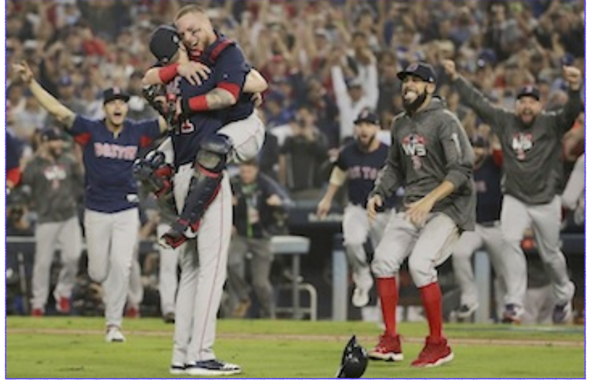
RED SOX are WORLD SERIES CHAMPIONS! 'Tornado Nation' congratulates Boston Red Sox on their 2018 WORLD CHAMPIONSHIP VICTORY!!