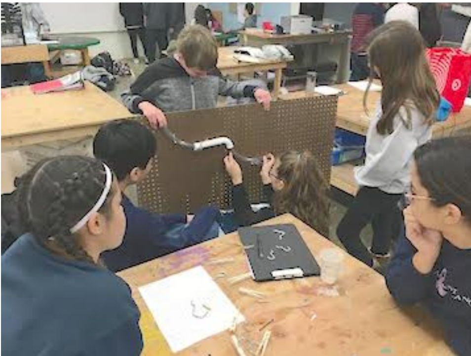
MHS math classes were engrossed in special projects for STEM Week.

aligns topics across STEM subjects and connects to other curricula. While STEM Week will be directed toward all students, there was a particular emphasis on middle and high school students, who are on the verge of thinking about college and careers.