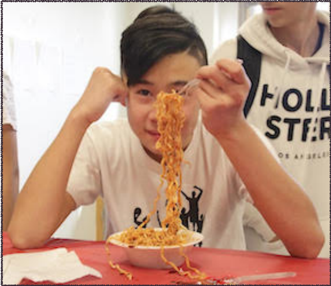
Now, THAT'S a Spicy Noodle!: The MHS Asian Cultural Club recently held a Spicy Noodle Challenge that drew an enthusiastic crowd! Students and staff enjoyed the event very much.