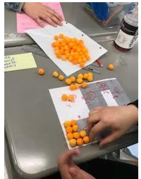
Spatial and numeric elements are involved in this project during STEM Week.