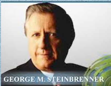
GEORGE M. STEINBRENNER

"Winning is the most important thing in my life, after breathing. Breathing first, winning next."