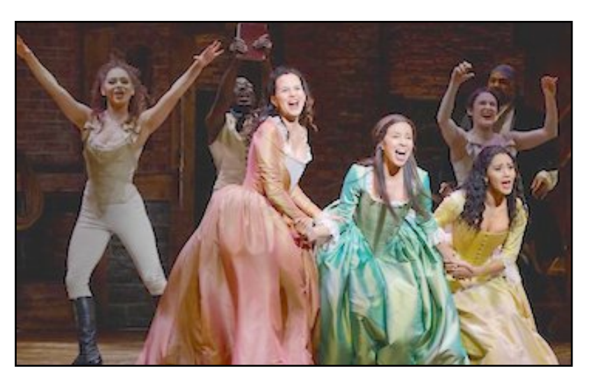
The ladies take the stage in a scene from Hamilton .

This fall Hamilton began a nationwide tour, starting with performances in Boston at the Boston Opera House and continuing onto 13 other cities and states. In concert with the actual theater performance, the Gilder Lehrman Institute of American History's Hamilton Education Program is giving Title 1 high schools an opportunity to see the award-winning Broadway musical at a nominal cost. On Thursday, October 18, 180 Malden High School students and 20 staff filled five buses to Boston and took part in the full-day Hamilton Education Program. While tickets for the show are $199.00 face value and are often re-sold for four or five times that amount.. or more, MHS students joined