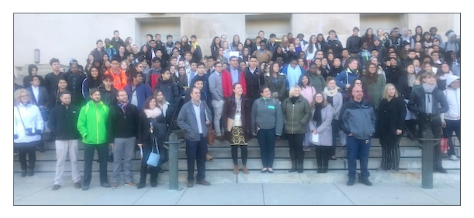
HAMILTON SENDOFF: Above, nearly 200 Malden High School students and 20 staff members gathered in front of MHS before they traveled to Boston to see Hamilton and take part in the all-day intensive education program "EdHam"