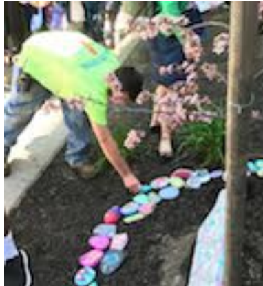
Placing stones at the memorial