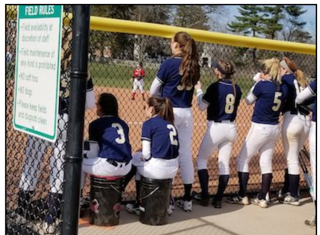
Big win over Melrose for Tornado softball!!