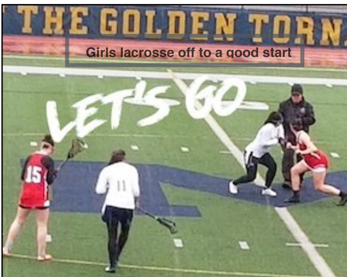
Girls lacrosse off to a good start