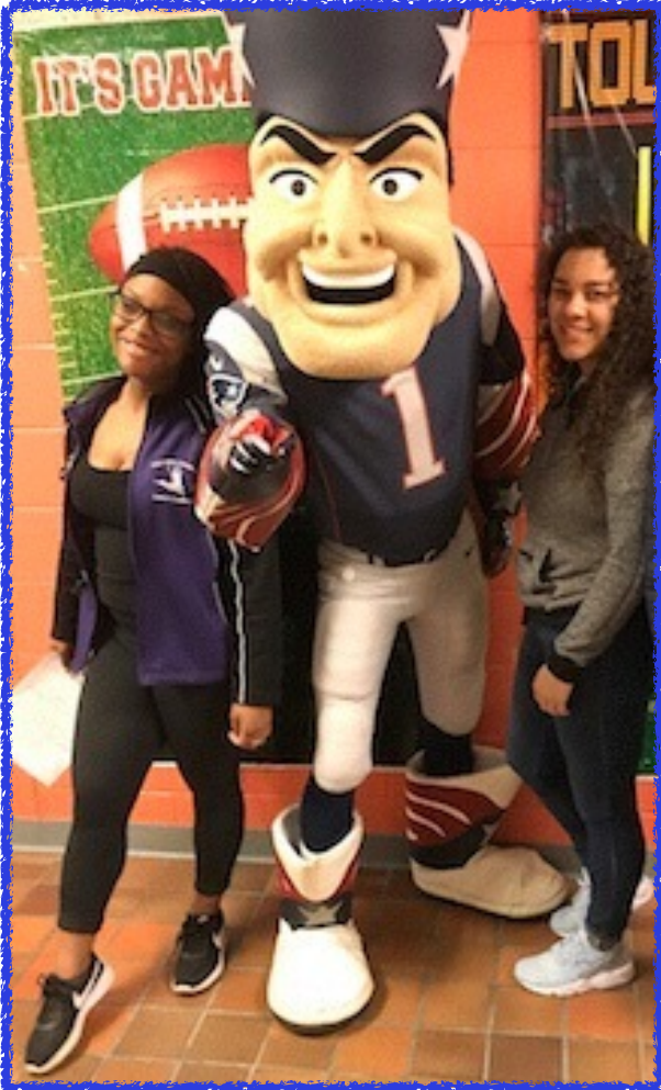
PAT THE PATRIOT GREETS NEWEST MHS FANS: Friday @ the NFL 'Fuel Up' Event