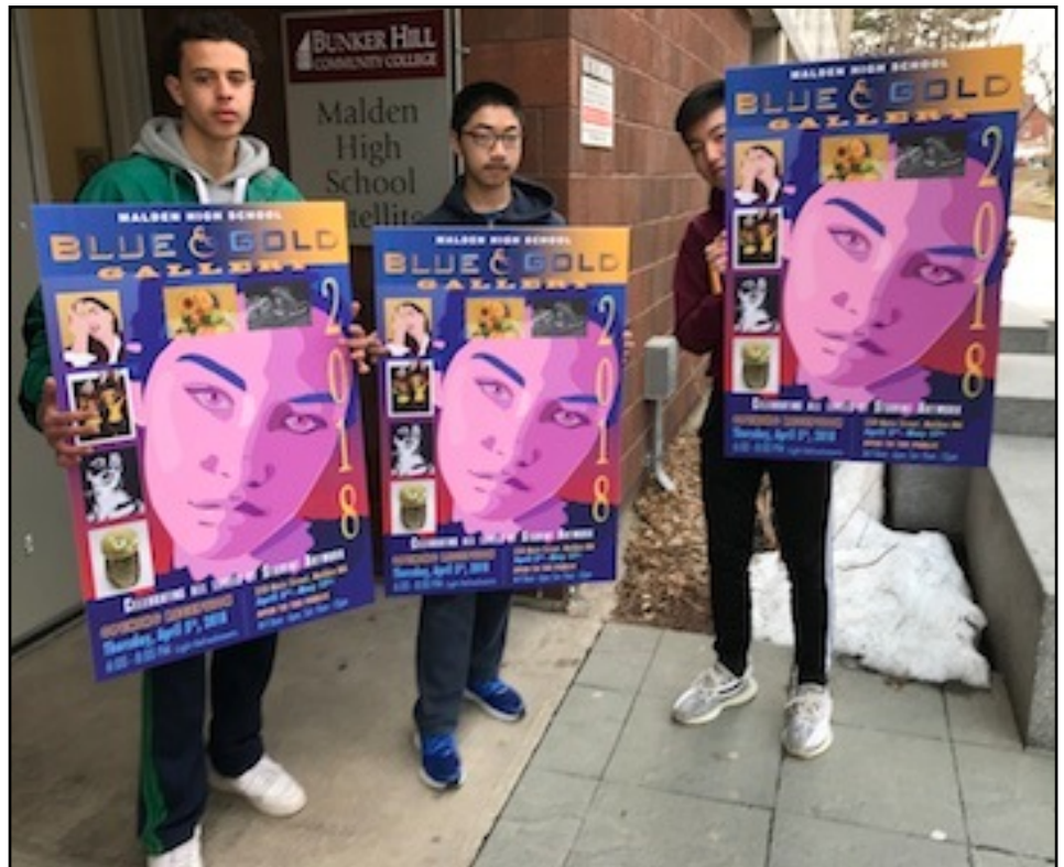
Our students display posters they are distributing in Malden Square inviting the community to view the Blue & Gold Gallery at the 350 Main St. building.

One of the highlights of the Malden High school year is always the Opening Reception for the Blue & Gallery, which is being held once again this Thursday, April 5 at 6:00 p.m. at the 350 Main St. building in Malden Sq. The annual display is shown during business hours 9 a.m.-5 p.m. at that site. Featured at the Blue & Gold Gallery are many original artworks by MHS art students they have created this year.