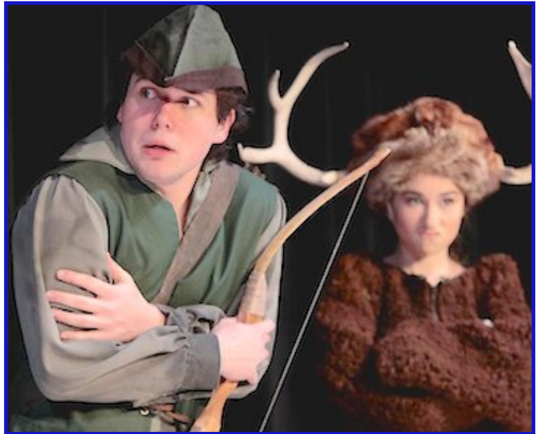
Malden High students will compete in a statewide playwriting competition