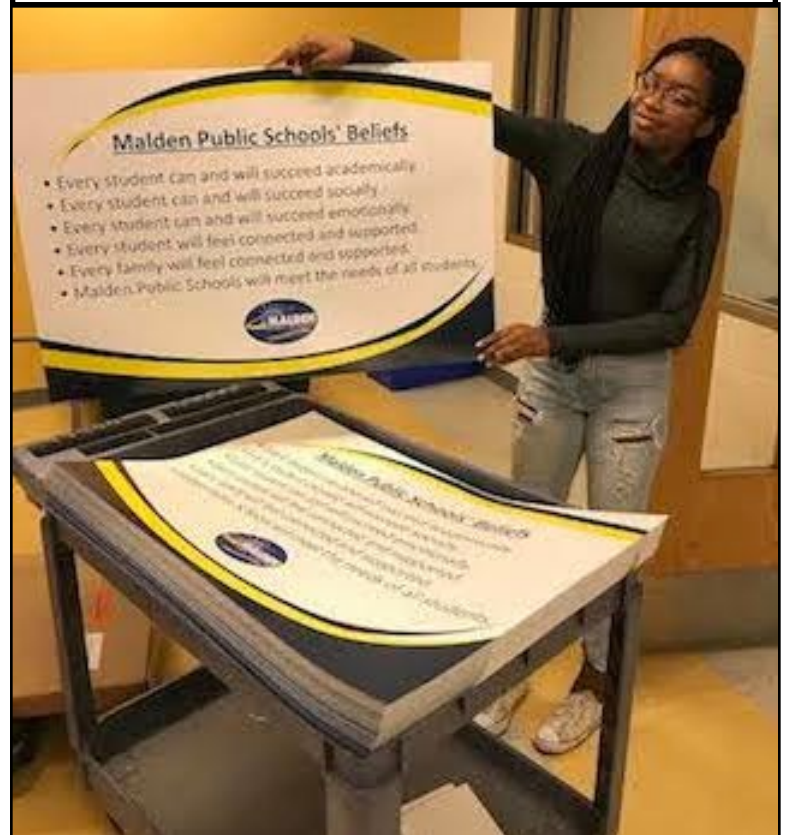
Signs listing the Malden Public Schools beliefs are being displayed in every classroom at Malden High School and in every classroom citywide