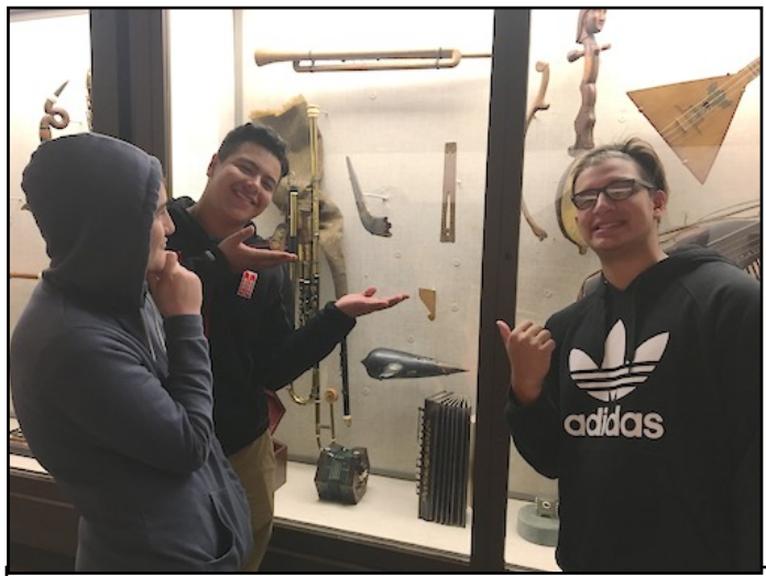
Malden High School Band Class students really enjoyed the antique instrument display