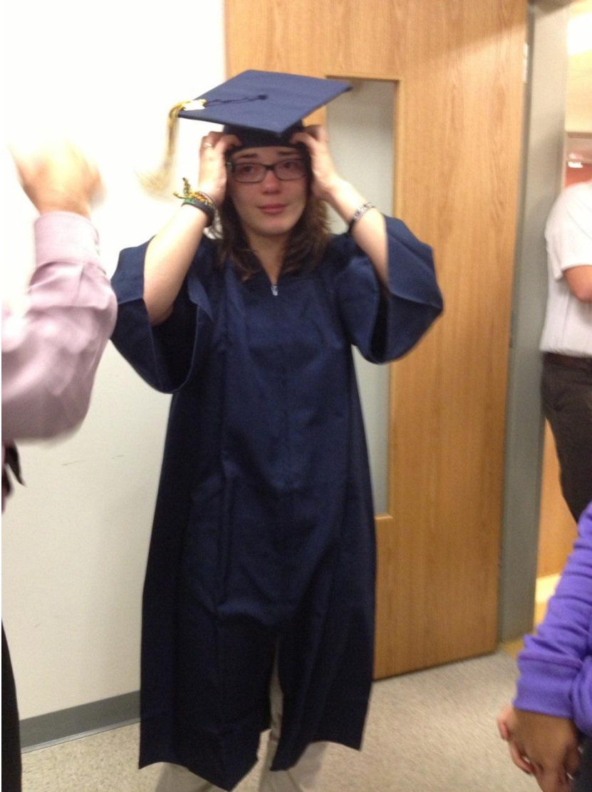
Graduating and moving on...making the most of your time here.