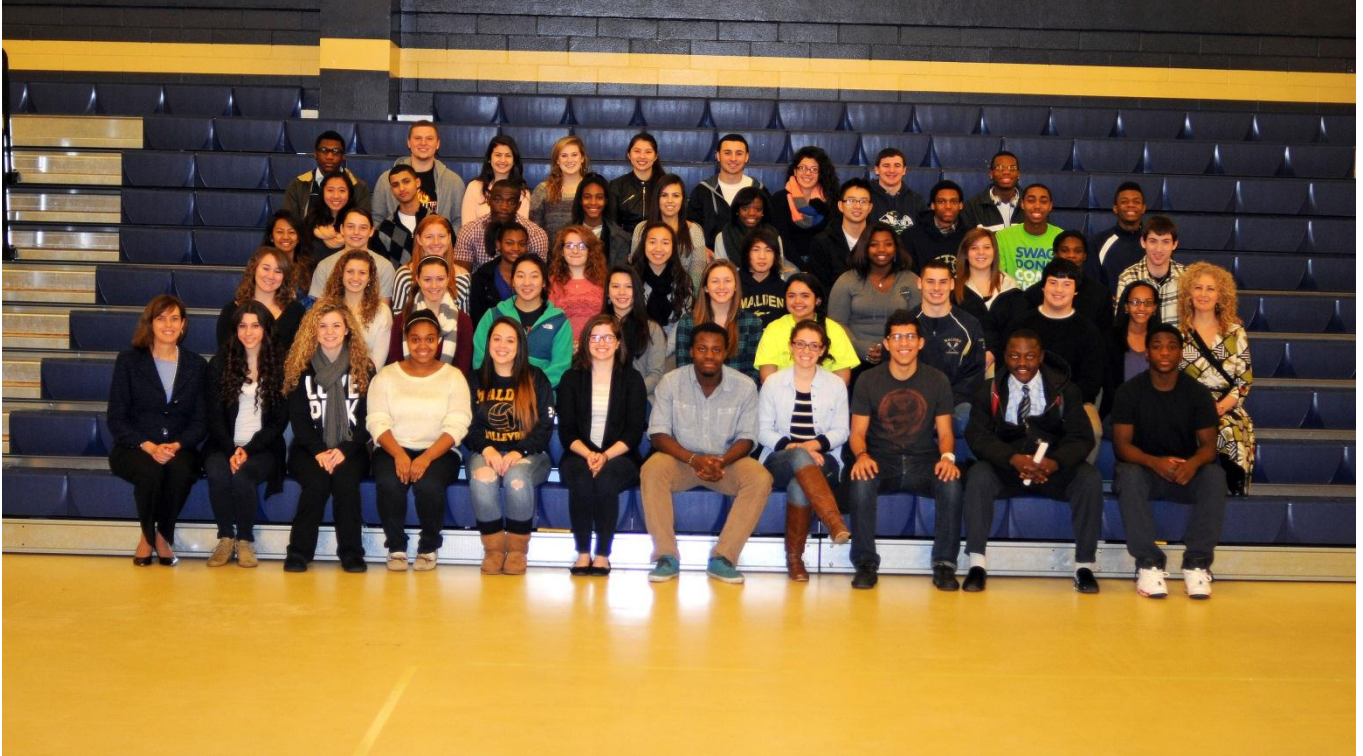
Captains Council with Senator Katherine Clark