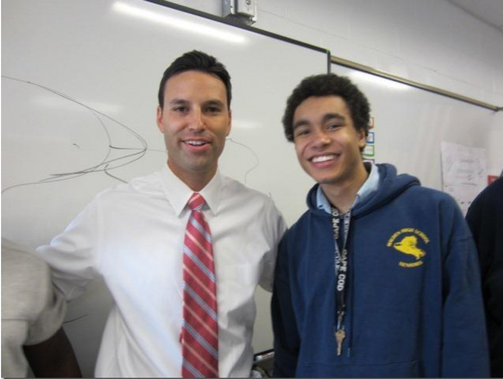
TV weatherman Todd Gutner visits our PACE classroom....