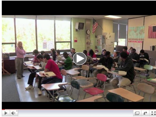
The Massachusetts RTTT Model Curriculum Unit Project

Ready to create curriculum units? Check out Creating Curriculum Units at the Local Level: an Interactive Guide on the ESE's web site. This guide is full of guidance, examples, tips and video links to help you through the development process.